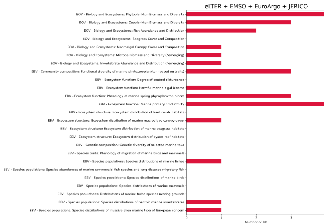
Figure 2 – Total number of RIs measuring specific bio-eco EOVs and EBVs (from D5.5)

diversity, EBV - functional diversity of phytoplankton and EBV - phenology of marine spring phytoplankton blooms), while the “EOV - Biology and Ecosystems: Fish abundance and Distribution” is the only variable measured by two RIs.