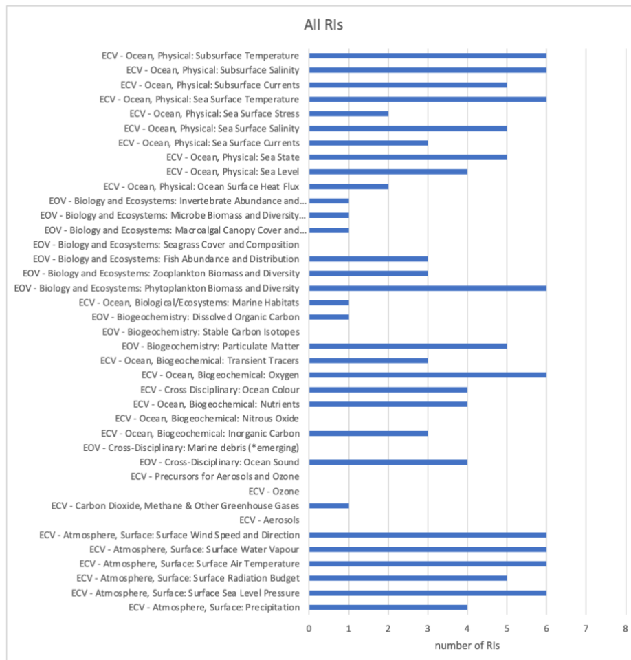
Figure 1 - Number of RIs contributing to the measurement of specific EOVs/ECVs (from D5.3)

From D5.3 it emerged that the majority of EOV/ECV are measured by many RIs, with few exceptions, in those connected with the atmospheric composition (e.g., ozone, aerosol) covered by other RIs not involved in WP5. It is clear how certain EOVs/ECVs are considered relevant for a wide range of studies, intercepting activities of many RIs. This particularly applies to all the ECV – Ocean, Physical (Temperature, Salinity and Currents), to the EOV – Biology and Ecosystem: Phytoplankton Biomass and diversity, ECV – Ocean Biogeochemical: Oxygen and to the full category ECV – Atmosphere, surface (see Figure 1 for details).