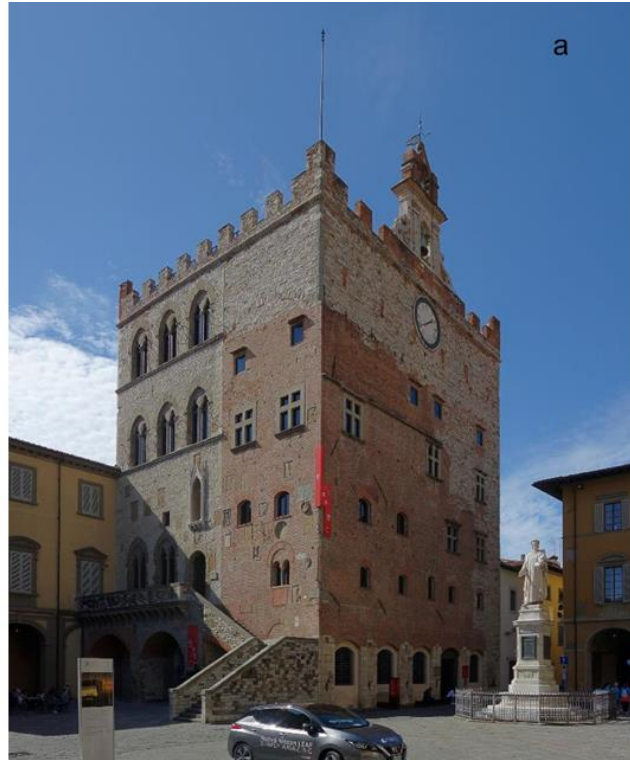
Figure 7. Image of the site above Palazzo Pretonio, Prato