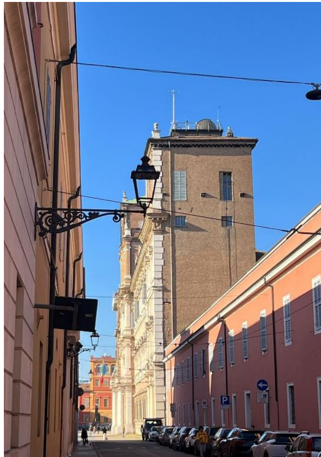
Figure 3. Image of the site above university of Modena.

The station was partially equipped thanks to the instrumentation provided by ITINERIS is currently under finalization and is expected to become operational by summer 2025. Once active, it will play a key role in expanding the national urban monitoring network and contribute valuable data for assessing urban carbon dynamics and evaluating the performance of Nature-Based Solutions.