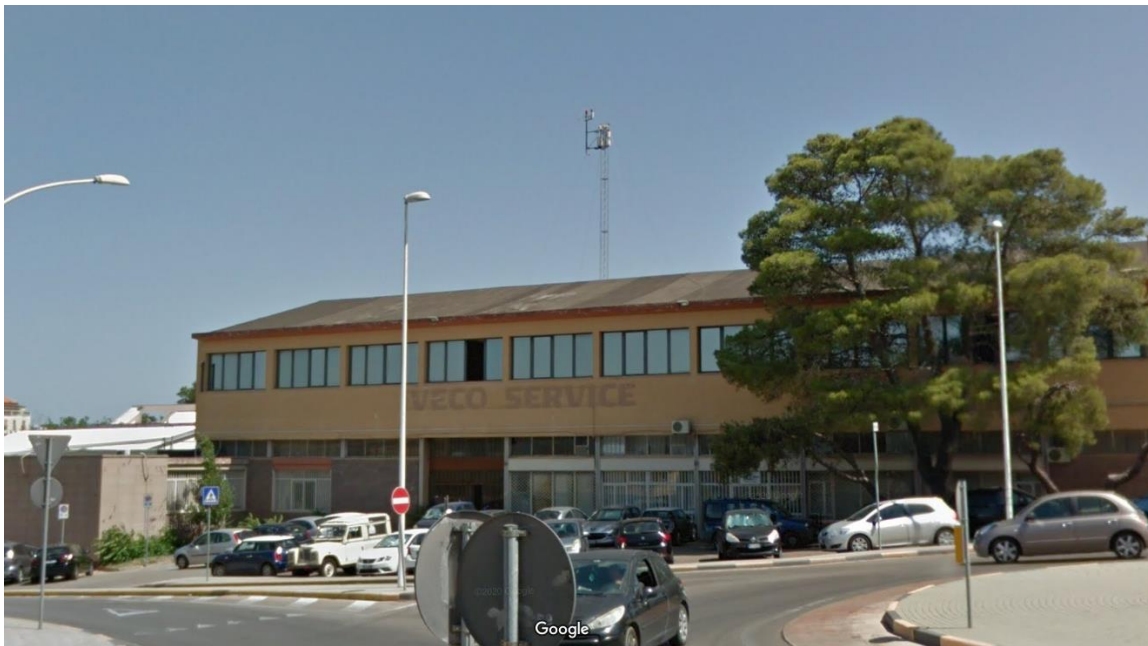
Figure 8. Image of the site in Sassari