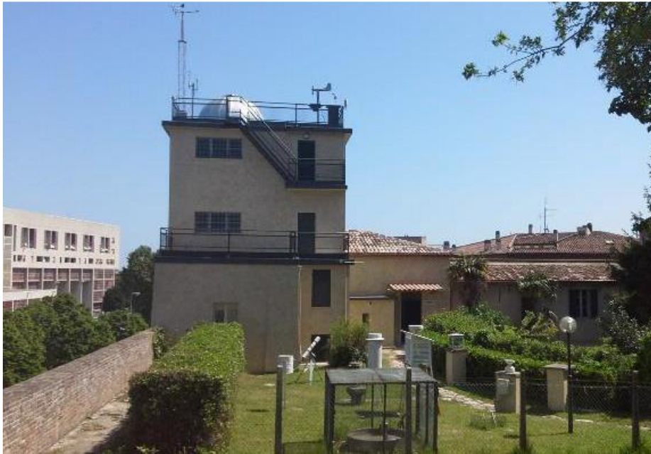
Figure 6. Image of the site above Osservatorio Valerio, Pesaro