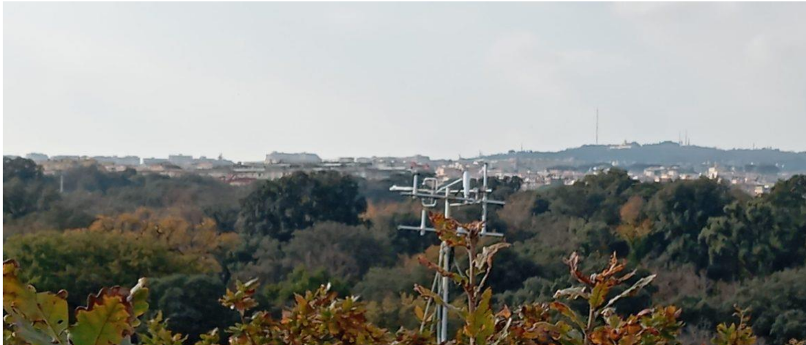
Figure 5. Bird's eye view of the Napoli - Capodimonte Station

historic urban woodland, allows for the direct assessment of the ecosystem services provided by an important type of NBS such as urban forests, particularly in relation to air quality regulation and carbon sequestration.