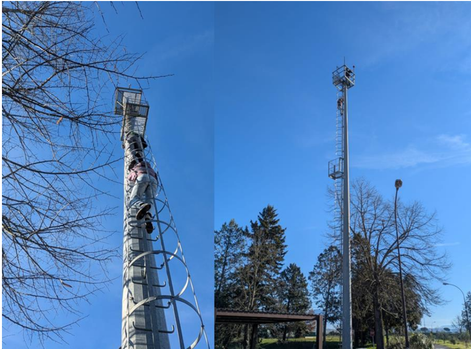
Figure 4. Image of the site above university of Montelibretti (Rome)