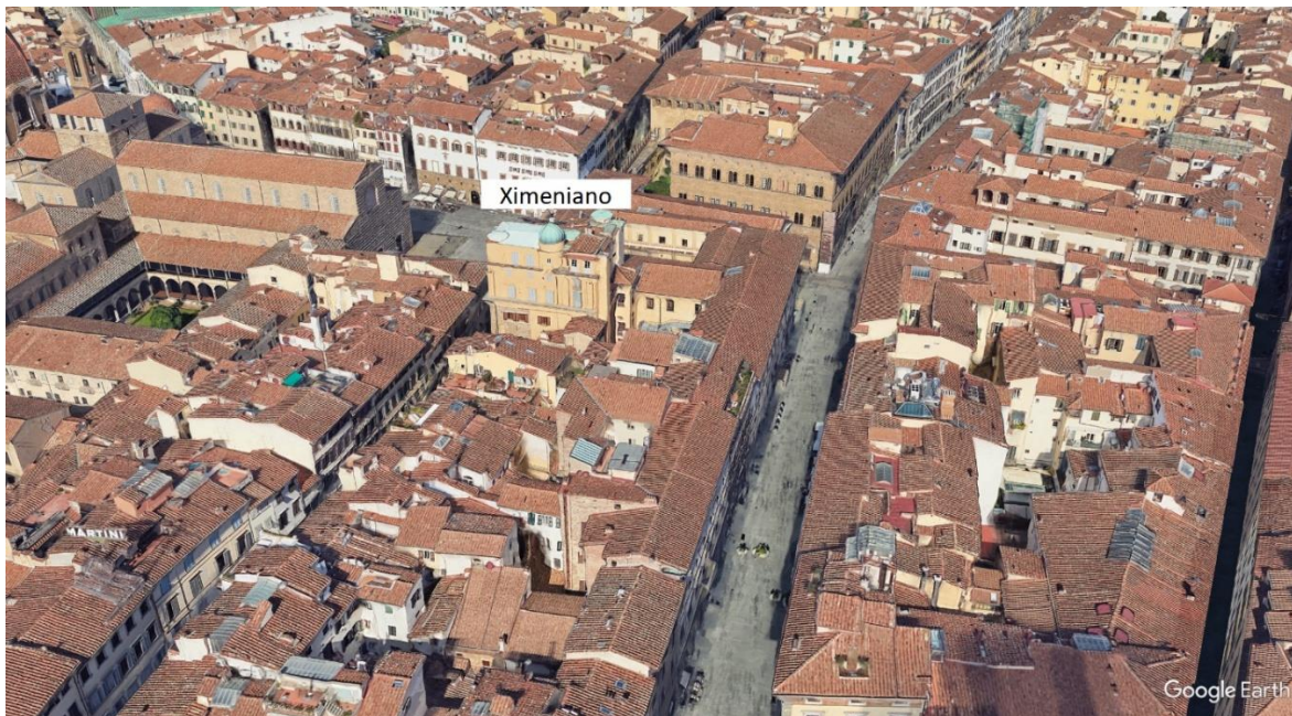
Figure 2. Image of the site above Xymeniano Observatory in Firenze.

monitoring of ozone ( O_3 ) and nitrogen oxides ( NO_x ), enabling the site to simultaneously assess greenhouse gas dynamics and air quality impacts in real time. This comprehensive instrumentation allows the site to contribute critically to the understanding of urban atmospheric exchange processes, especially in relation to the effectiveness of Nature-Based Solutions (NBS) in mitigating carbon emissions and improving air quality. By integrating carbon and pollutant flux measurements, the Firenze tower represents a valuable node within the national and European urban monitoring network, supporting both long-term scientific research and policy-relevant environmental assessments. The site is also part of ICOS and Associated station and it has been labelled in May 2024 by the ICOS General Assembly.