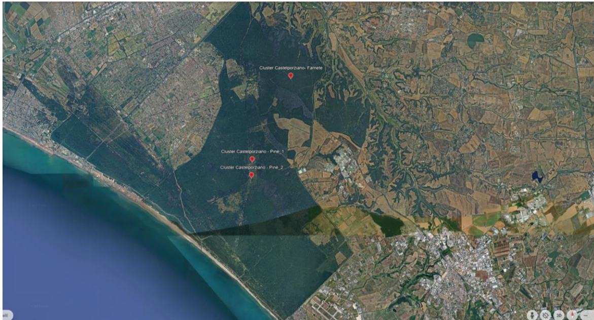
Figure 2. Location of the Sites of Castelporziano Cluster

restoration: reforestation with a mix of autochthonous deciduous species and some area left to the natural evolution but in different conditions (grazing protection or unprotection). This gives the possibility to create together with the ICOS tower a new unique long-term observatory. For this sites Activity 8.6 will provide the all the sensors, the power supply system, the data transfer, data management and data processing.